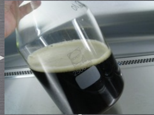
1 L THEN GO UP TO 5 - 10 L STERILE WORT AT AMBIENT TEMP