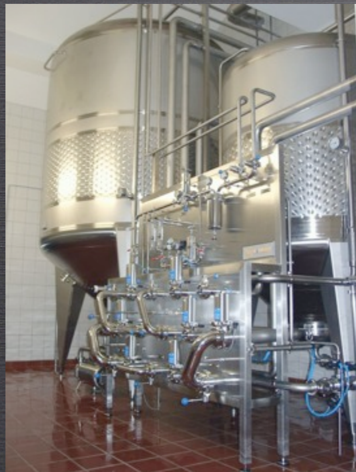
RESUSPENDED PRESSED YEAST