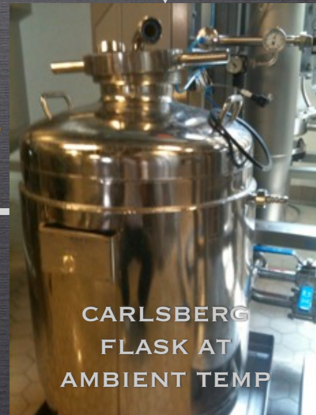
CARLSBERG FLASK AT AMBIENT TEMP