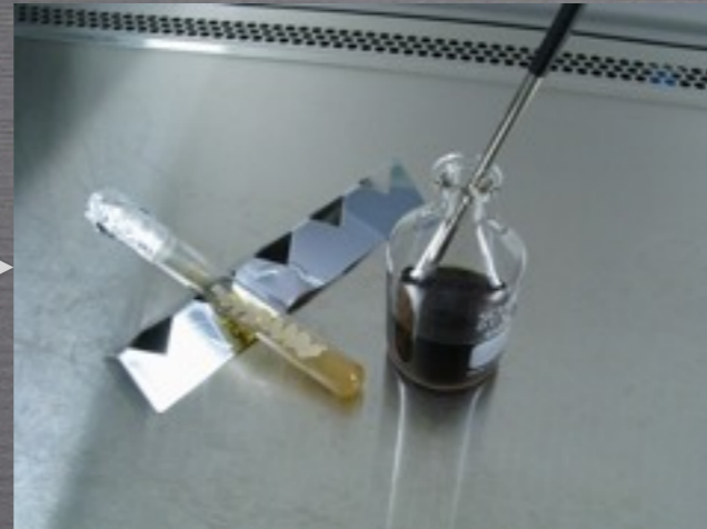
100 - 200 ML STERILE WORT AT AMBIENT TEMP